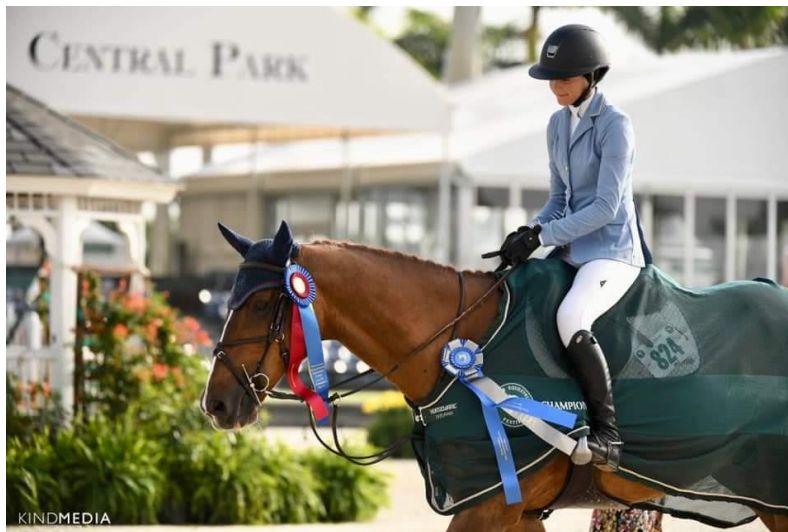
Chaplin W is February's Show Jumping Hall of Fame Horse of the Month.